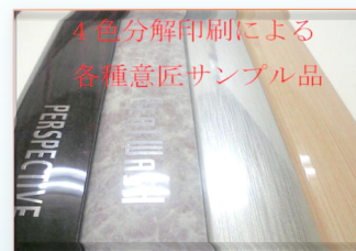
Full color insert molding