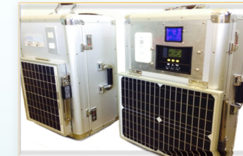
Stabilized power supply Emergency generator