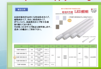
LED lighting system