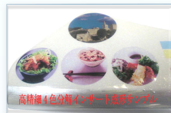
High-definition 4-color separation silk screen printing