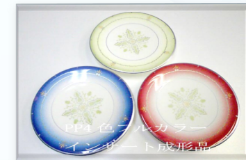
PP Film insert molding